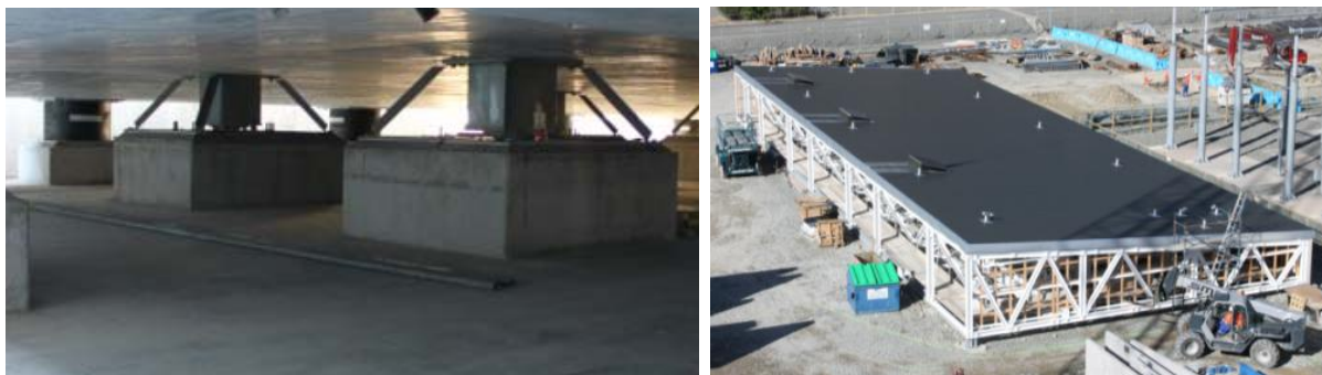
Figure 2: Base isolation system (left) and valve hall roof structure (right) at Benmore

The structural steel for the roof of the valve hall was also manufactured offsite at Gracefield in Lower Hutt (for Haywards) and Timaru (for Benmore) and was pre-assembled into sections and painted before being transported to site. For programme efficiency and safety reasons, the entire roof structure, weighing approximately 140 tonnes, was constructed at ground level and lifted into place in a two-crane super-lift. The roof structure will support the 50 tonne weight of the three suspended quadruple valves. Seismic dampers will be installed in the valve hall floor to control the swaying of the quadruple valves during seismic events.