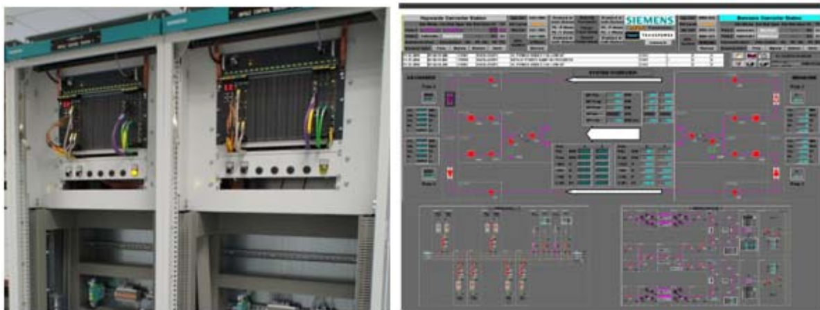
Figure 6: TDC controls in Bipole Control (left) and HMI screen example (right)

Hardware design is based on a digital control system utilising the Siemens TDC system. This is a modular system made up of a rack and a number of input/output, processor, and communications cards (Figure 6) depending on the needs of each control system. A similar approach was implemented with the existing HVDC control system delivered 20 years ago, however the new controls make a much greater use of digital communications networks rather than using analogue and digital signal exchange between systems. Field bus communications are used to gather status information from the various AC and DC plant items and to issue control signals to field plant. Ethernet and specialised high speed networks are used between the core control systems to share information, implement logic and action protective functions.