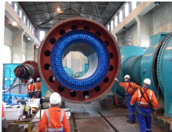
Figure 8: Haywards Synchronous Condenser C1 – New Stator Winding

In addition to this, regular maintenance outages are required for both existing poles and a major bushing replacement at Fighting Bay (where the undersea cables come ashore in the South Island). Except for the synchronous condenser work, all these works must be completed before the commissioning of Pole 3. To carry out these works and ultimately commission Pole 3, it has been necessary to enter into a period of significant outages on the HVDC link since the end of March 2011. In particular, the line work requires extended outages of at least one Pole if the work is performed conventionally. However, the following steps are being taken to minimise outages: