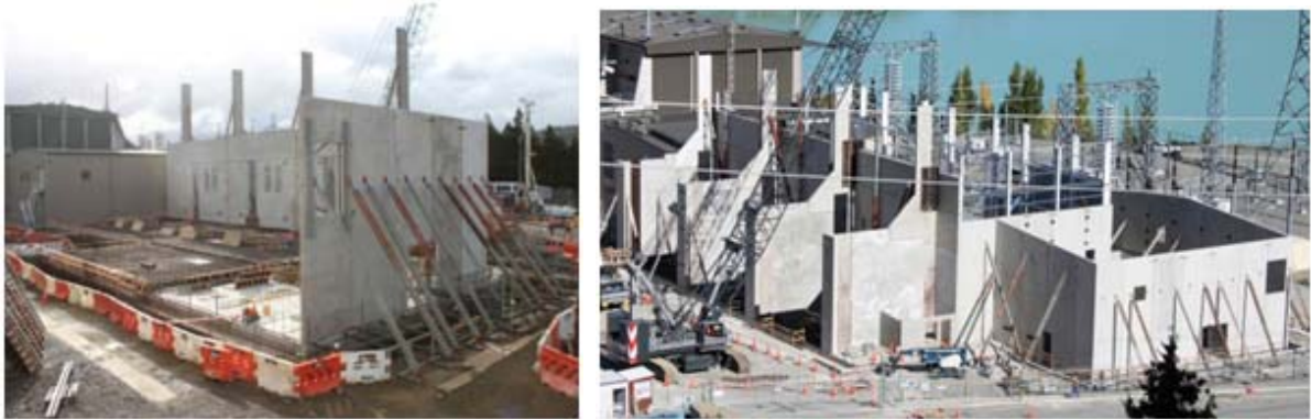
Figure 3: Pole 3 building construction progress at Haywards (left) and Benmore (right), at the end of March 2011

A yellow card reporting system (suggestion box format) was implemented during the Site Improvement Works sub-project at Haywards, and has continued at Haywards and been implemented at Benmore for the Pole 3 Project works. The system has been an effective tool for achieving buy-in and obtaining feedback from workers on safety observations and suggestions of ways to continually improve site safety.