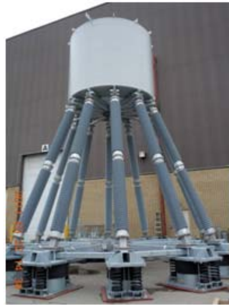
Figure 5: DC smoothing reactor mounted on seismic dampers at the Canadian factory; to enable a seismic pull test to verify calculations.

The plant is specified to qualify to stringent international seismic requirements and this is verified by either modelling and calculations or by subjecting the plant to shake table testing. The large and bulky items like the converter transformers, mounted on base isolated foundations have been qualified by calculation because shake tables large enough for the task are not available. Smaller items, like instrument transformers and switchgear mounted on non-base isolated foundations, are being qualified by subjecting them to shake table testing at independent test facilities in Europe and America. This equipment is first electrically factory routine tested, then shake table tested, and then factory routine tested again to confirm that the electrical characteristics have not changed.