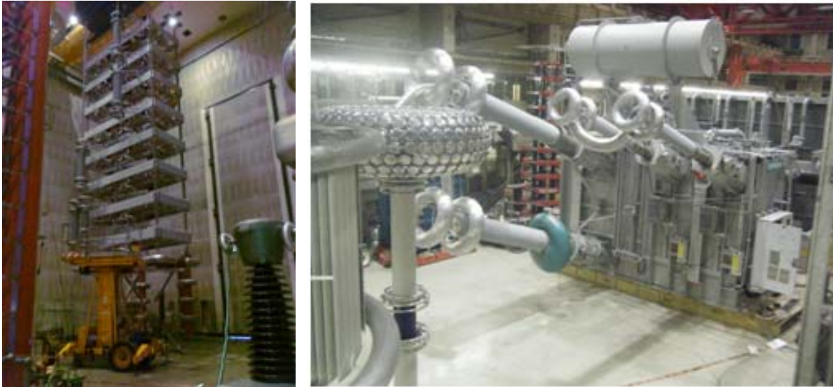
Figure 4: Thyristor quadruple valve impulse testing at University of Karlsruhe, Germany (left) and converter transformer factory impulse testing at Nurnberg (right)

All the valves associated with the 12 pulse bridges have been manufactured, appropriately tested and are awaiting shipping to the sites. Manufacturing of most of the remaining items of primary plant has started.