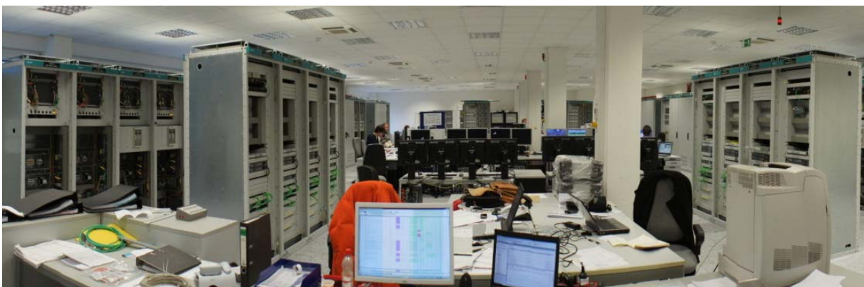
Figure 7: Photo of layout in the FAT area

During this phase of the project physical proof of controls, protection and logic functions and performance of the overall interconnected AC and HVDC system will be provided. The key objectives of this process are to confirm the dynamic performance and models relevant to system security; ensure that protection systems function correctly and meet performance requirements; and to complete tests which will not be able to be undertaken on-site for system or safety reasons.